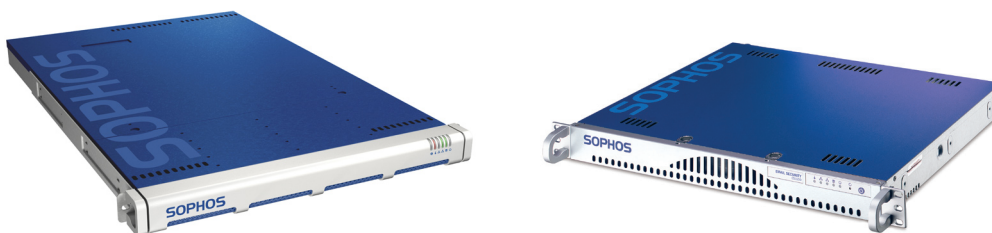
ES4000 and ES1000: fully integrated email gateway protection from Sophos