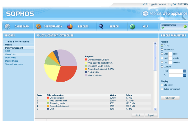
The security and control you require